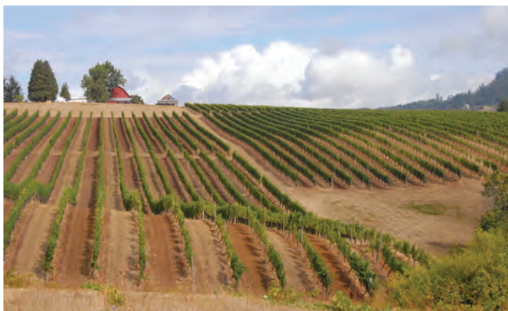
Ridgecrest Vineyards | Ribbon Ridge AVA Willamette Valley | Oregon

When we first set foot on Ribbon Ridge in 1980, we knew it was something special. There was an indefinable magic to the place, in the low-slung, rolling hills that rise and fall like the breath of a slumbering child. It was undeniably alive, and bursting with potential.