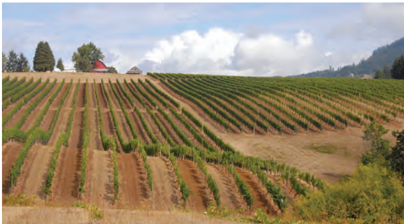
Ridgecrest Vineyards | Ribbon Ridge AVA Willamette Valley | Oregon

When we first set foot on Ribbon Ridge in 1980, we knew it was something special. There was an indefinable magic to the place, in the low-slung, rolling hills that rise and fall like the breath of a slumbering child. It was undeniably alive, and bursting with potential.