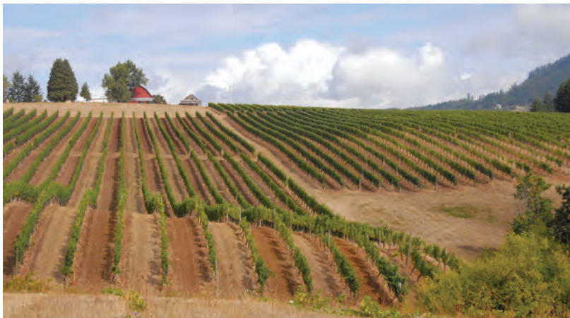
Ridgecrest Vineyards | Ribbon Ridge AVA Willamette Valley | Oregon

When we first set foot on Ribbon Ridge in 1980, we knew it was something special. There was an indefinable magic to the place, in the low-slung, rolling hills that rise and fall like the breath of a slumbering child. It was undeniably alive, and bursting with potential.