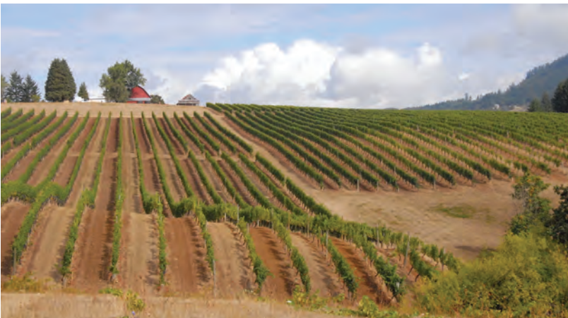
Ridgecrest Vineyards | Ribbon Ridge AVA | Willamette Valley | Oregon

When we first set foot on Ribbon Ridge about 40 years ago, we knew it was something special. There was an indefinable magic to the place, in the low-slung, rolling hills that rise and fall like the breath of a slumbering child. It was undeniably alive, and bursting with potential.